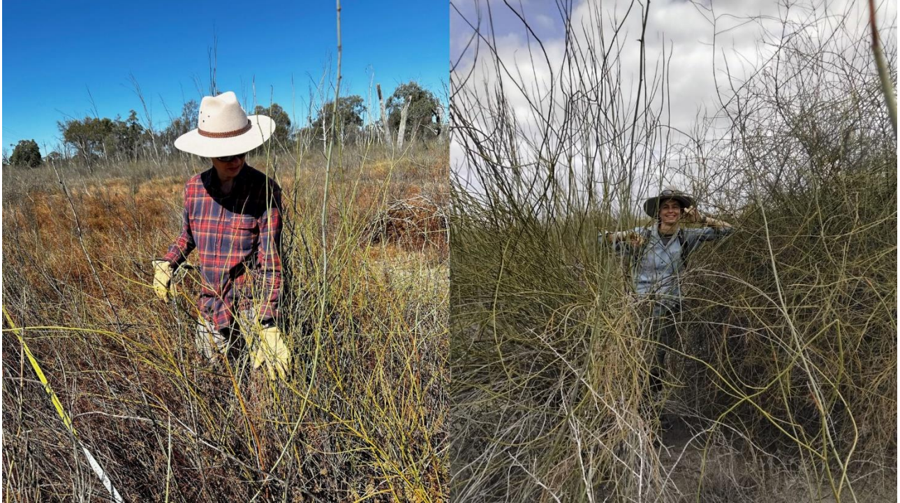
Ecologists conducting lignum monitoring.

Weir pool manipulation is having a positive impact on the condition of lignum in certain areas along the river in South Australia, showing that fluctuating water levels are important for a healthy floodplain system.